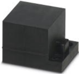
Small blind sleeve, material: NBR

Please be informed that the data shown in this PDF Document is generated from our Online Catalog. Please find the complete data in the user's documentation. Our General Terms of Use for Downloads are valid ( http://phoenixcontact.com/download )