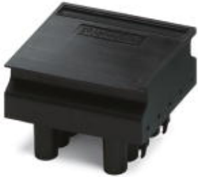
Power bridge, for Inline power-level terminal blocks

Please be informed that the data shown in this PDF Document is generated from our Online Catalog. Please find the complete data in the user's documentation. Our General Terms of Use for Downloads are valid ( http://phoenixcontact.com/download )