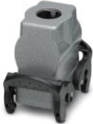
HEAVYCON B10 sleeve housing, with double locking latch, height: 56 mm, with 1 x M20 thread, straight cable outlet

Please be informed that the data shown in this PDF Document is generated from our Online Catalog. Please find the complete data in the user's documentation. Our General Terms of Use for Downloads are valid ( http://phoenixcontact.com/download )