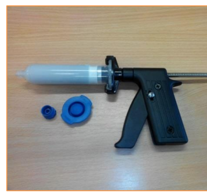
4. Remove the tip of the barrel