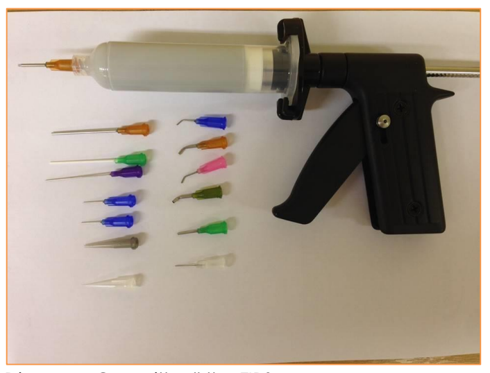
Dispenser Gun with all the TIPS

(1.5" or 0.5") tubing for application onto sensitive areas. Easily drags along edges and around corners; flexible for access to hidden areas.