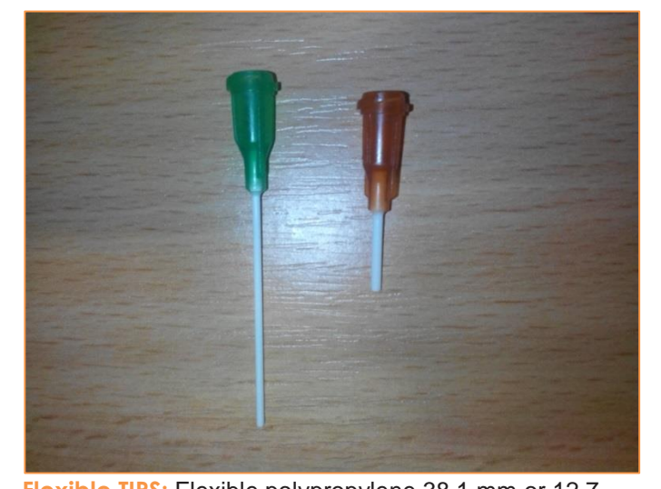
Flexible TIPS: Flexible polypropylene 38.1 mm or 12.7 mm (1.5" or 0.5") tubing for application onto sensitive areas.

Resists clogging of thick, particle-filled materials. Use with UV-cure adhesives, sealants and grease.