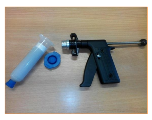
2. Remove the lid of the barrel