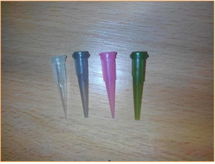
Smooth flow tapered TIPS: Unique tips provide smooth flow of all fluid types.

Molded of polyethylene with UV-light block additive and SafetyLok ^{\text{TM}} hub design.