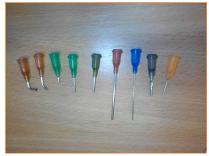
Precision Stainless Steel TIPS: Burr-free, polished and passivated stainless steel tips with polypropylene SafetyLok hubs.