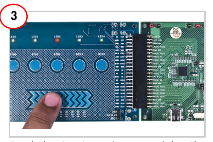
Touch the CapSense button or slider. The respective LEDs lights up.