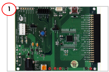
Remove CY3280-20x66 Universal CapSense Controller Board from package. Connect the CY3280-SLM board (to be purchased separately) to the P2 connector.