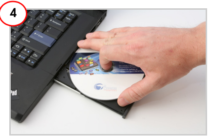
Insert the kit CD into the CD drive of your PC. Install the kit contents, PSoC Designer, PSoC Programmer, and Bridge Control Panel. After the kit contents and software are installed, PSoC Designer can be used to customize existing example projects or create new ones.