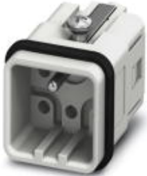
HEAVYCON plug insert, Q5 series, 5-pos., crimp connection

Please be informed that the data shown in this PDF Document is generated from our Online Catalog. Please find the complete data in the user's documentation. Our General Terms of Use for Downloads are valid ( http://phoenixcontact.com/download )