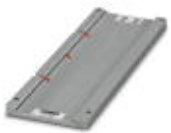
Magazine, for CMS-P1-PLOTTER, for accommodating UC-EMP..., UC-EMLP...