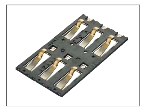
Block-Style SIM Connector, 0.30mm height (Series 78545)